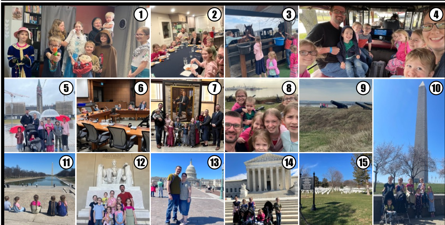
(1-2) It was a blessing to reconnect with two different families that we became friends with while serving in Liberia, who are now back living stateside, (3-4) while travelling through Pennsylvania, we got to take a buggy ride through Amish country and tour an Amish farm, (5-7) our travels took us to our capital in Ottawa, where we got to meet our MP (Member of Parliament), get a tour of the Parliament Building, and sit in on the daily Question Period, (8-15) a missions conference in Baltimore, Maryland enabled us to see Fort McHenry (8-9) and tour Washington D.C., with stops at the Washington Monument (10-11), the Lincoln Memorial (12), the U.S. Capitol Building (13), the Supreme Court (14), and the Arlington National Cemetery (15).