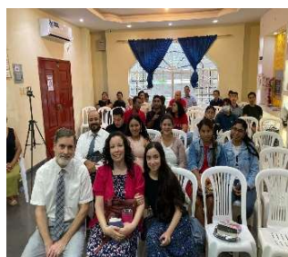
Sunday service in Milagro

Praises: New supporting church/ opportunity to be with previous and other missionaries to Ecuador at last conference