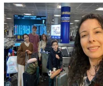
Our trip to the States