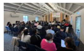
RECENT SERVICE A FULL HOUSE AT A RECENT SUNDAY MORNING SERVICE