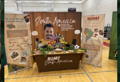
Global Impact Rally Display Table