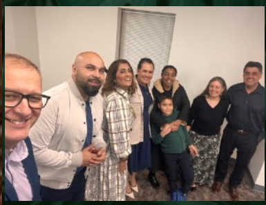
Brazilian church plant in the USA. Dear Friends!