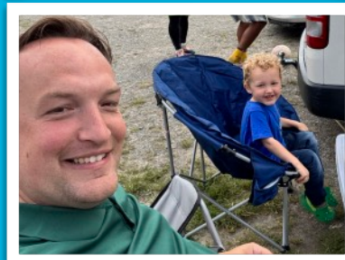
TOP: A new family photo is attached to the email with this letter!