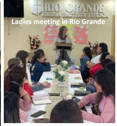
Ladies meeting in Rio Grande