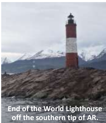
End of the World Lighthouse off the southern tip of AR.