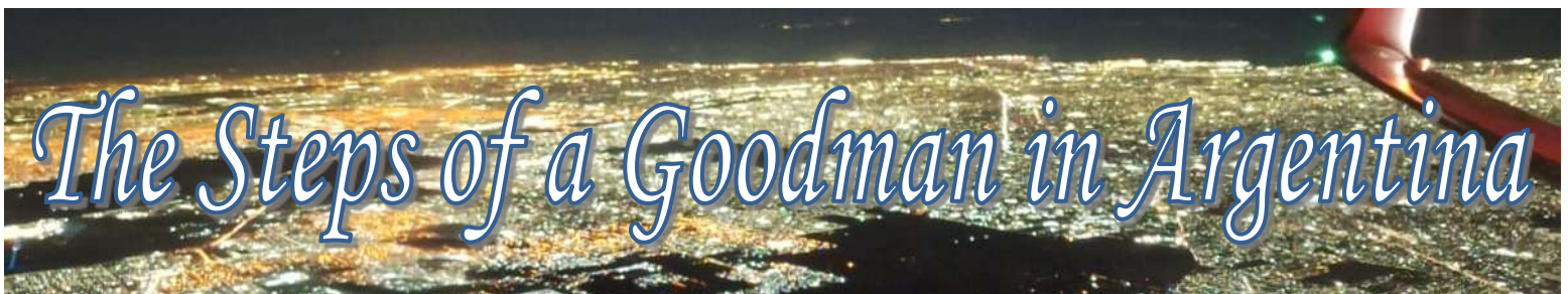
The Steps of a Goodman in Argentina