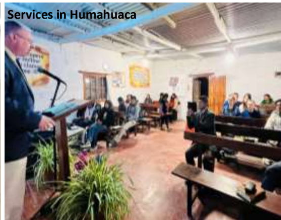
Services in Humahuaca