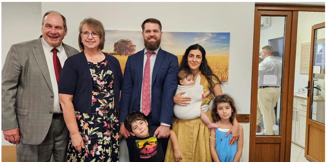
It was an honor to have our pastor here in July