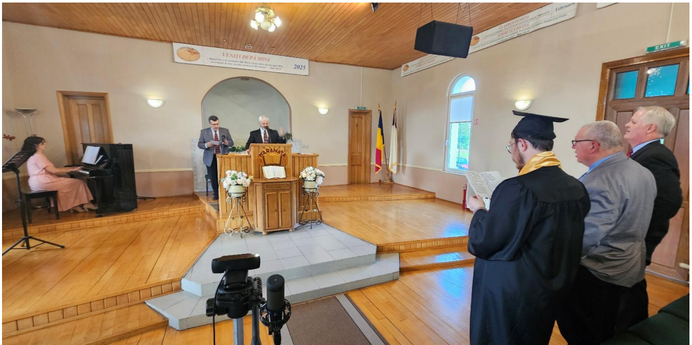
College graduation 2025