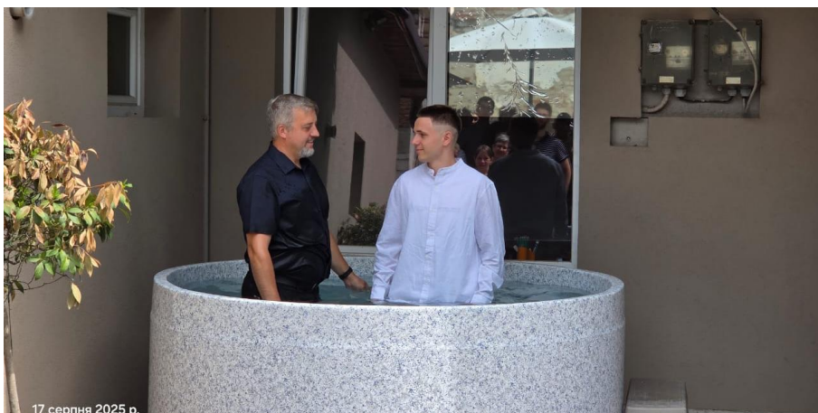
We have had 9 people baptized over the last two months!