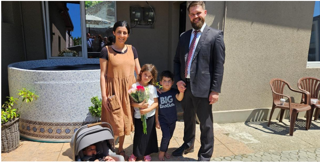
It was an honor to baptize my daughter in July