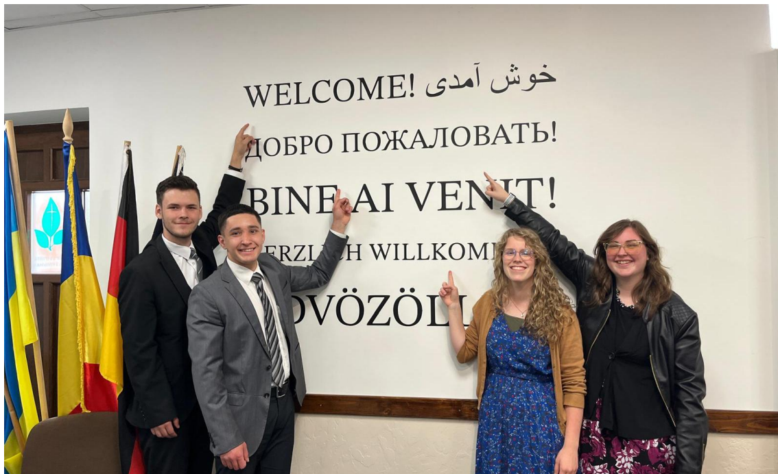
The Baptist College International is truly international