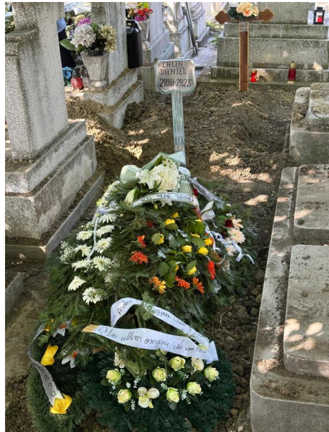
A dear friend and former graduate of our college joined the Ukrainian Foreign Legion and was killed while on a training mission in Ukraine. The burial was August 20 th .