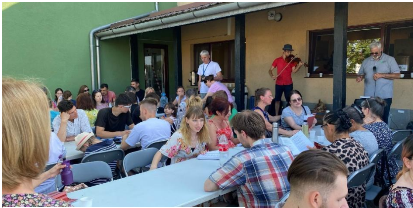
In June we had a church picnic