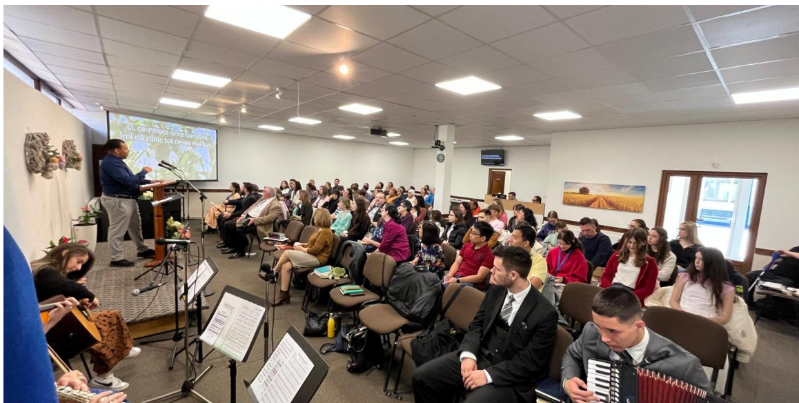
Church has been averaging between 80-100 on Sunday AM