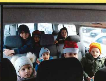
After School Care