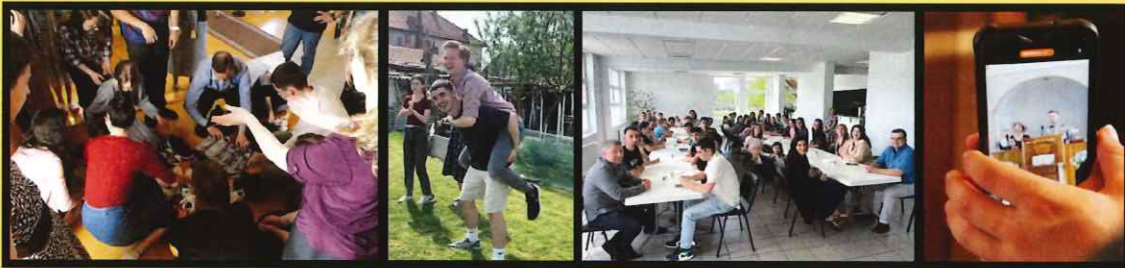
2025 Youth Conference