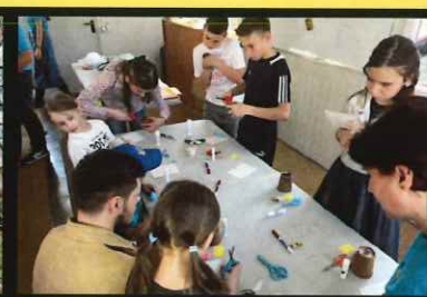
Christian Children's Club