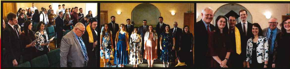
Graduation Bible Conference