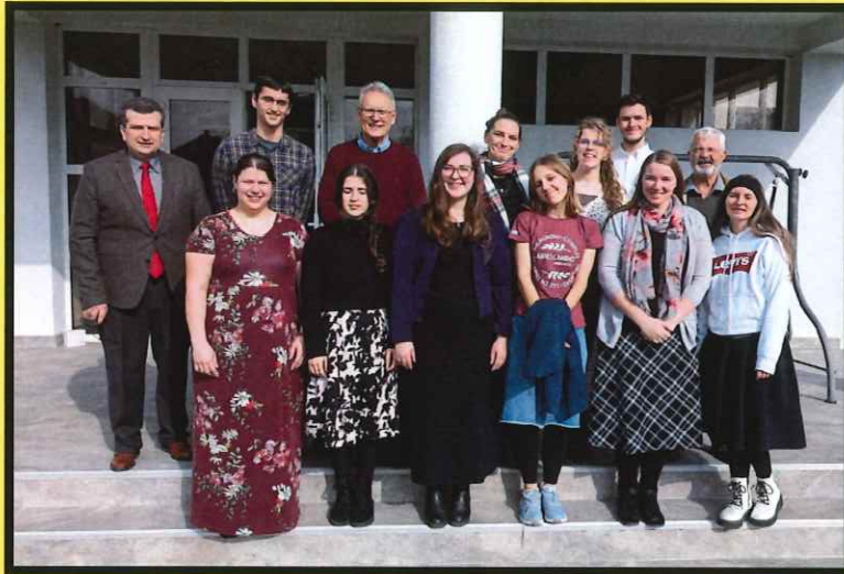
Spiritual Gifts Modular