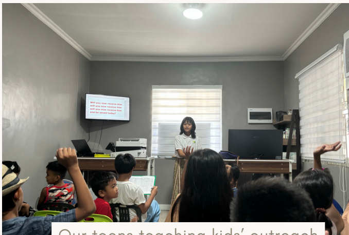
Our teens teaching kids' outreach