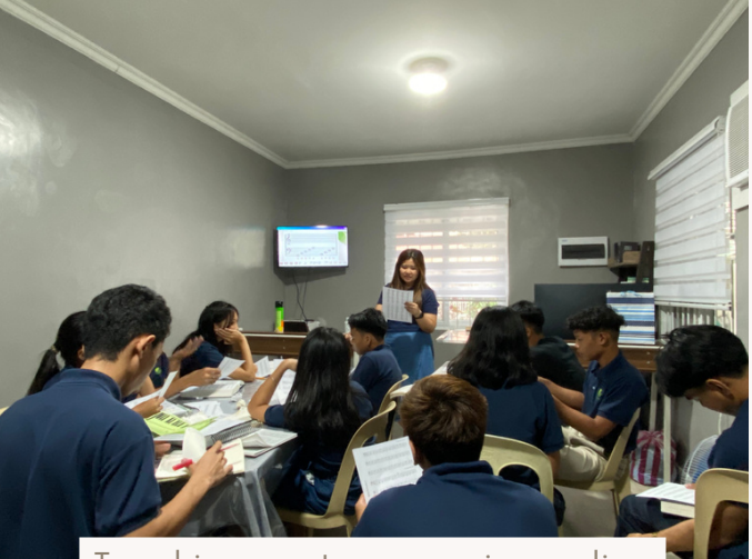
Teaching our teens music reading

Most of the ministries here in GBBC involve our teens. They are alive and enthusiastic group that want to serve the Lord. I'm truly grateful for their willing hearts; they are my team in any ministry here. They faithfully minister in media, soul winning, kids' outreach, music, choir, Sunday School, and now, in orchestra. They started learning violin and recorder back in March and are diligent in playing the congregational songs every Sunday.