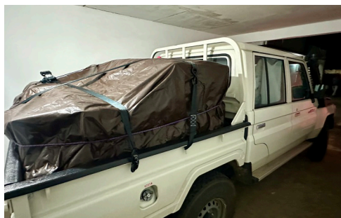
Ready for the drive back to Brazzaville.