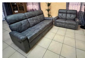
New furniture for Christmas!

Expecting Great Things, The Caviness Family