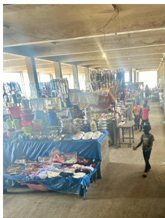
Central market of Owando.