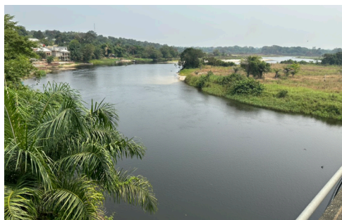
The Kouyou river in Owando.

Reaching the Republic of Congo for Christ.