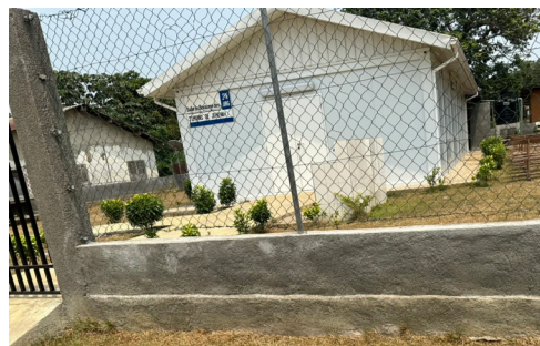
Jehovah's Witness Kingdom hall in Owando