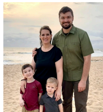
Family Time at the ocean.

Sent Out By: Victory Baptist Church of Roseburg, OR.