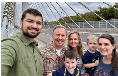
An encouraging visit from our BIMI directors