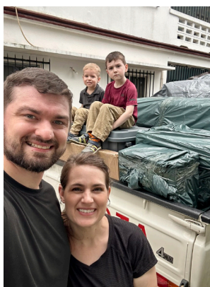
Loading the truck with all the blessings from the container