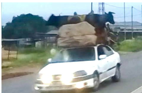
This is a Toyota corolla with two fully grown cows strapped to the top. There is never a dull moment driving in Congo!