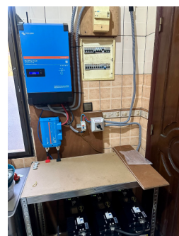
Our home battery backup!