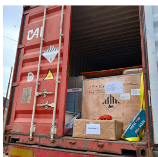
The container finally arrived!