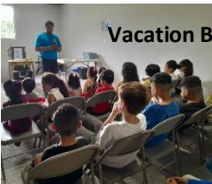
Vacation Bible Schools 2024