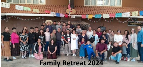
Family Retreat 2024