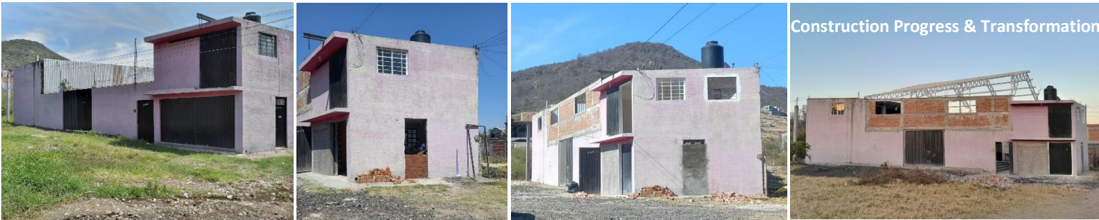
Construction Progress & Transformation