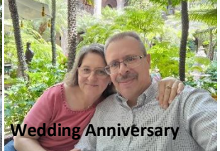
27th Wedding Anniversary