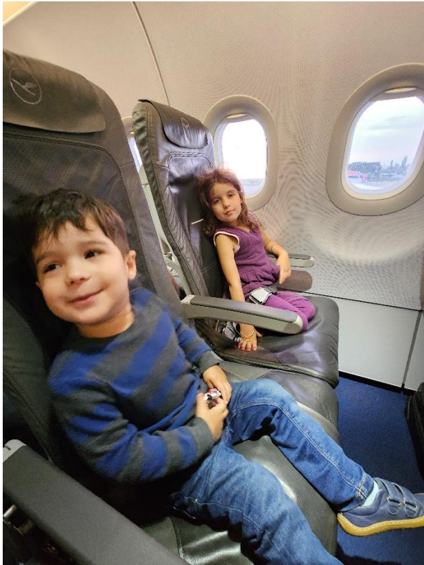
Heading home from furlough!