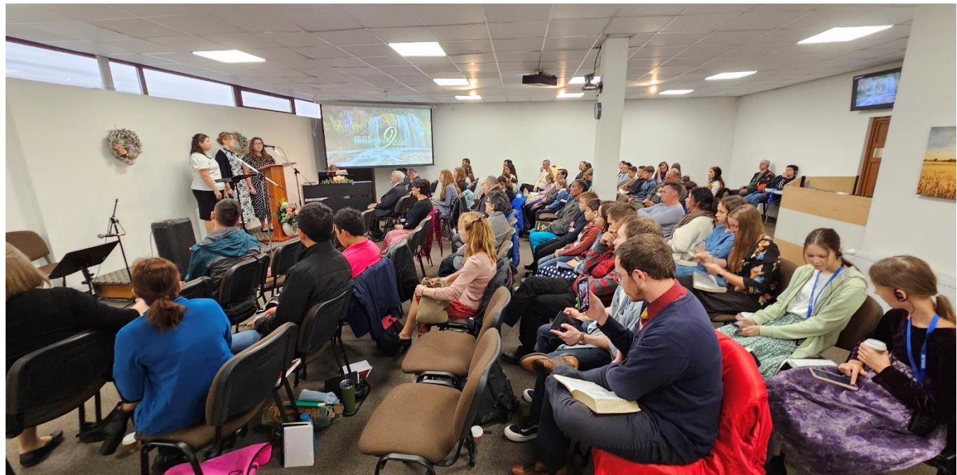
The first church service with our college students back. We are running about 90 on Sunday mornings.