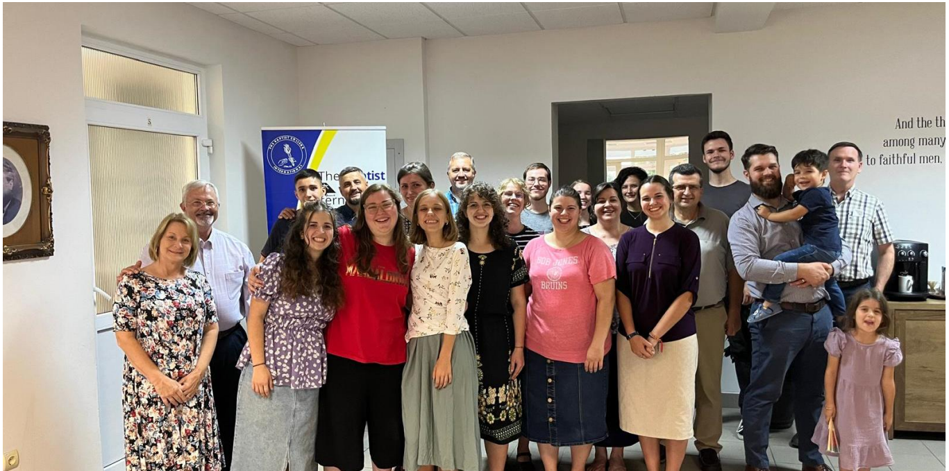
The first day of the 2024 Fall Semester at TBCI