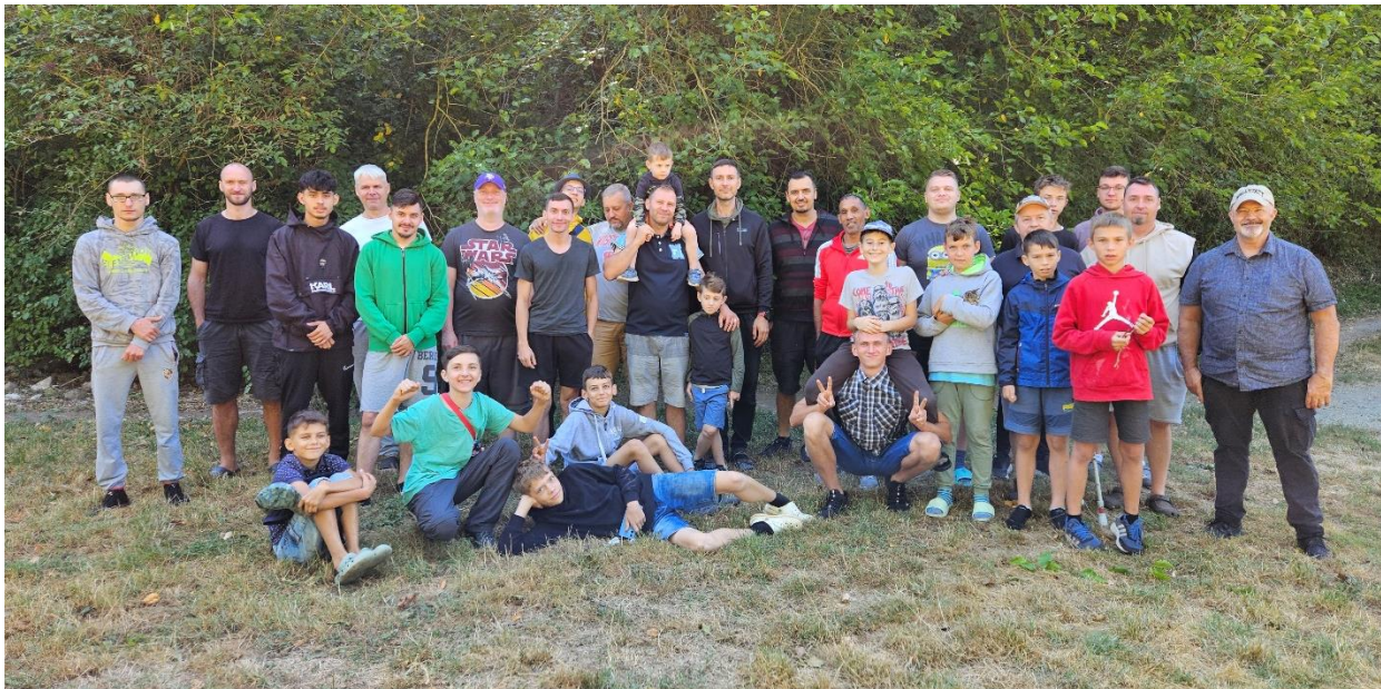
The group from Men and Boys Campout